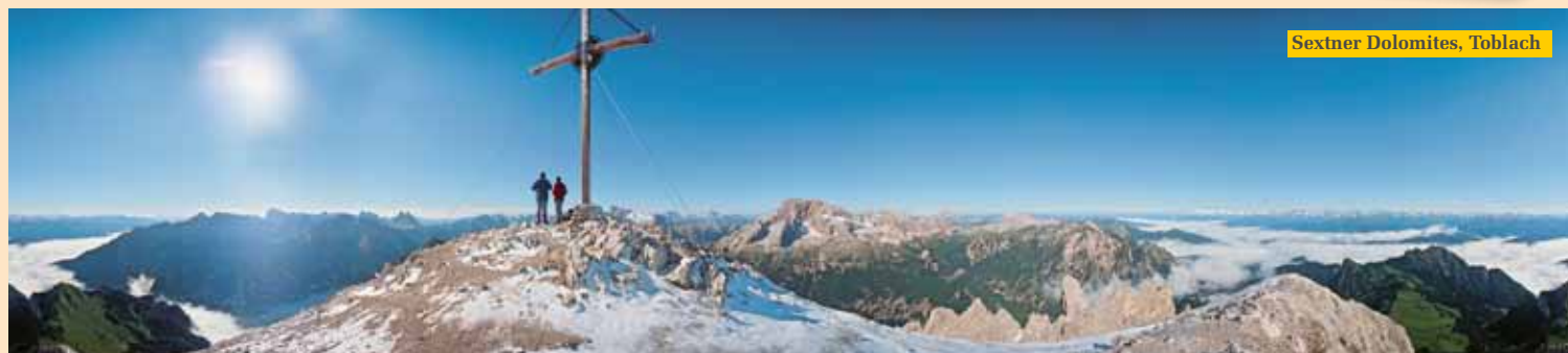
Sextner Dolomites, Toblach

From June to September 2012 free programme for kids over 3 years old on Monday, Tuesday, Wednesday and Thursday from 9.30 am to 5.00 pm lunch included