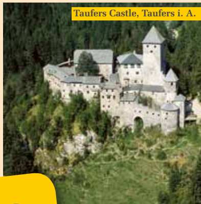
Taufers Castle, Taufers i. A.