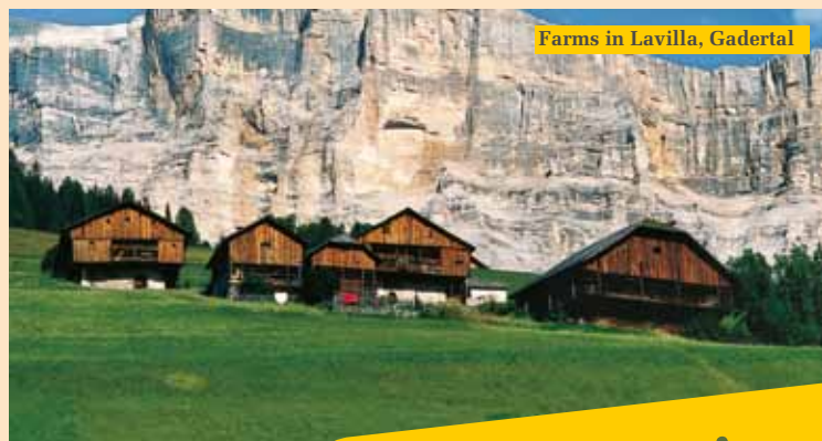
Farms in Lavilla, Gadertal