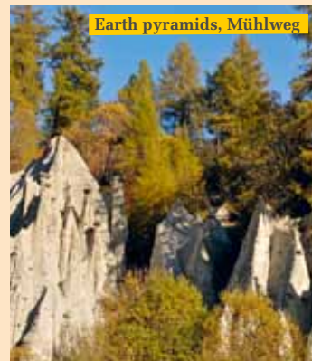
Earth pyramids, Mühlweg